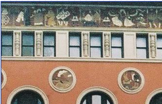
The structure's recently restored exterior boasts such rich Italian Renaissance features as a detailed mosaic frieze and seven decorative medallions.

These guidelines were balanced with a desire to preserve certain existing elements of this historical treasure.