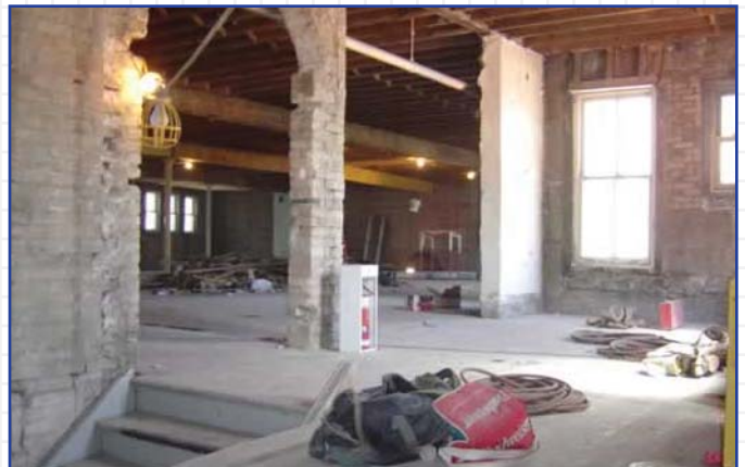
Once the interior was gutted, one of the first steps to creating a healthy, durable and energy-efficient building envelope was to have Icynene® soft foam insulation and air barrier installed.