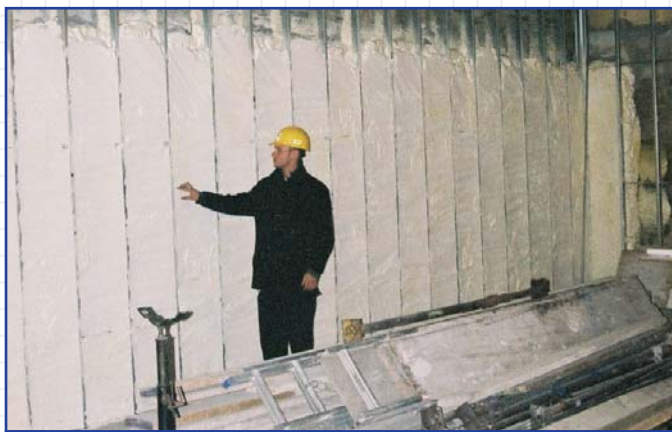
Penta Protective Coatings, Icynene Licensed Dealer in West St. Paul, Manitoba, sprayed Icynene® into the exterior walls of the building to protect the shell from a major source of energy loss – air leakage.