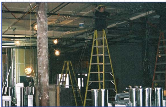
Icynene® complements the new air quality system installed in the building, by locking out allergens and other pollutants and allowing building occupants to control the quality of the indoor air.