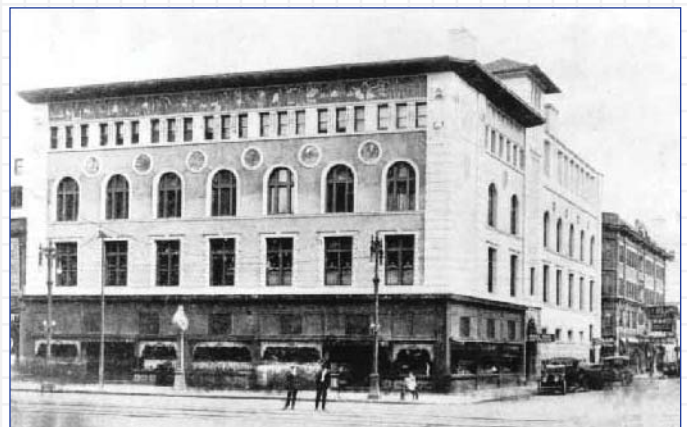
The former Birks Building with its new ground floor exterior and the Birks retail store on the ground floor, ca.1912.